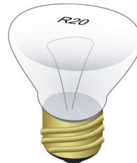
10,000-Hour Life Expectancy